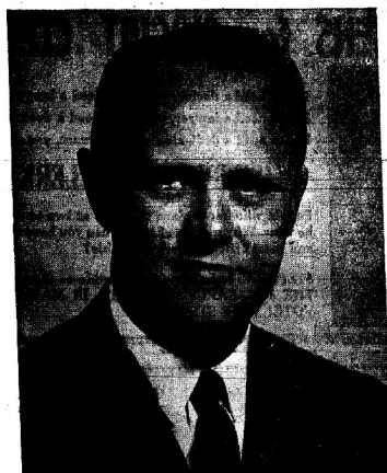
EDWARD T. BREATHITT